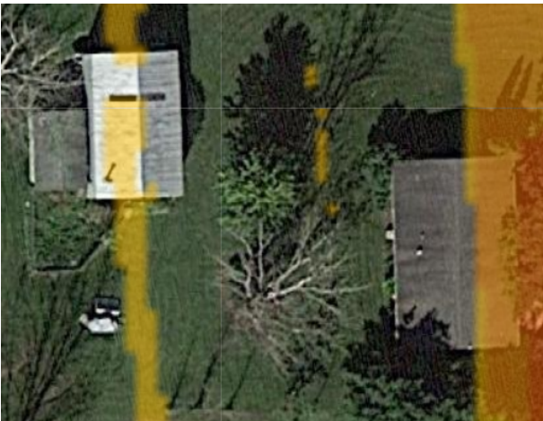
Left building covered by a lower RSSI level (i.e. yellow) than the building on the right (i.e. orange). These buildings are covered by nLOS / NLOS coverage in 3 GHz.

cnHeat allows for RSSI to be understood at all locations. Different colors correspond to different minimum RSSI levels. Understanding the signal level received at a building translates into knowing the maximum plan that can be sold to a customer.