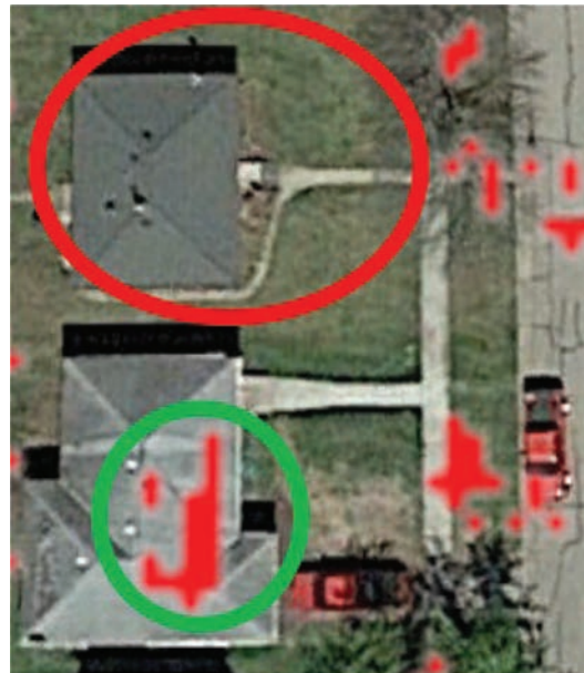
Bottom home can be connected, with the SM install locations predicted for the red shaded area of roof. cnHeat predicts the top home as unable to be served, preventing a failed truck roll.

The accuracy of the heat maps generated by cnHeat saves time and labor costs on customer installs. Because optimal installation locations are identified in advance, the installer can simply place the equipment immediately in the predetermined locations at the deployment site, then verify coverage from predicted to actual.